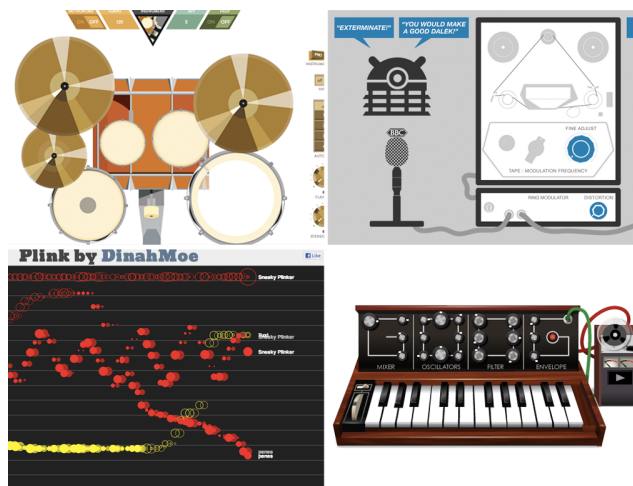
Figure 1: Music Applications built with Web Audio API

Before the advent of new form factors such as smartphones and tablets, most music applications were developed for the professional market. The difference in form factors introduced new paradigms by emphasizing casual, playful and social quality of the application. The success of mobile apps contributed to a newly emerged market for music software by embracing these key elements [16]. It is also worth mentioning that some mobile applications are reportedly used for professional music production. Thus, the boundary between casual and serious production is getting increasingly ill-defined.