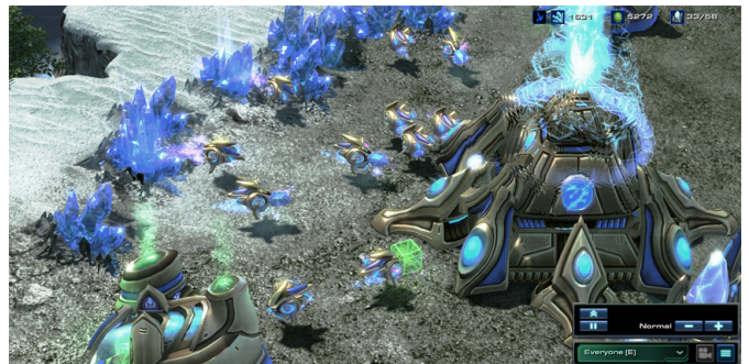
Figure 2: Harvesters mining minerals and vespene gas, which triggers musical events.

Consider moving a unit or group of units from point A to point B. In a FPS game, a player has control over a single character and simply moves that character from A to B. In StarCraft 2 , a player issues the move command to a select group of units and chooses the destination. A pathfinding algorithm takes over and handles getting units from A to B in the shortest time possible. While Blizzard has not publicly discussed its pathfinding technique, many community members inferred that StarCraft 2 uses techniques based on sophisticated flocking AI 2 , which attempts to mimic the movements of a flock of birds or a school of fish. Craig Reynolds explored and implemented one of the earlier models for flock simulation for Boids, a generic flocking creature. Flocking consists of a combination of steering behaviors - the most fundamental behaviors that allow a character to navigate their surroundings in a lifelike manner [5]. Such artificial intelligence behaviors have been employed for musical purposes in Hongchan Choi's Lush , an "organic" musical sequencer program in which groups of boid creatures, controlled by flocking behavior, activate musical patterns as they flit about the screen [2]. SoundCraft, by harnessing artificial intelligence behaviors already present in StarCraft 2 , presents similar opportunities to orchestrate musical works.