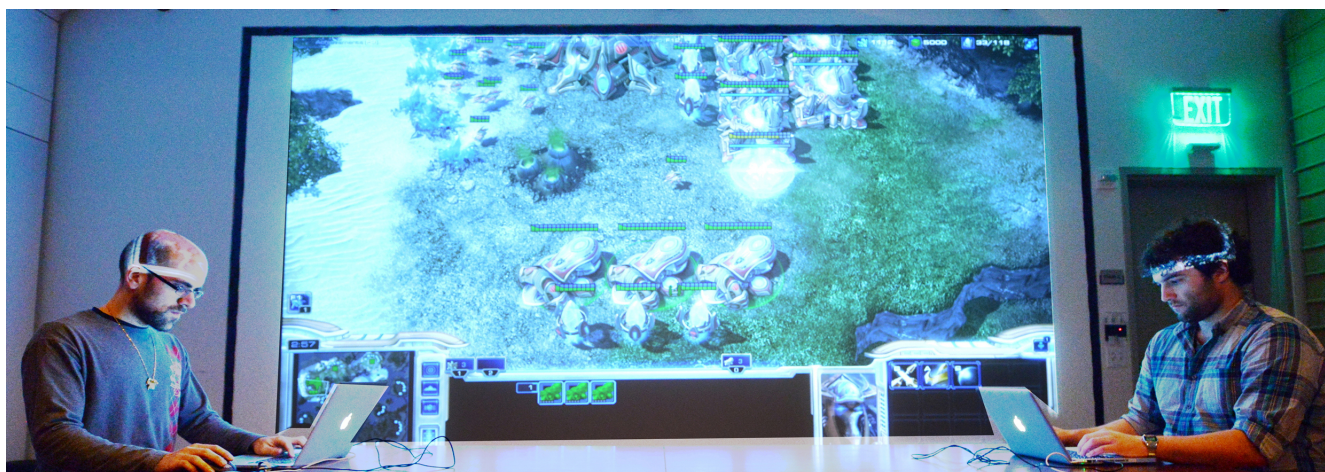
Figure 1: A SoundCraft performance in progress.

Ge Wang Center for Computer Research in Music and Acoustics (CCRMA) Stanford University ge@ccrma.stanford.edu