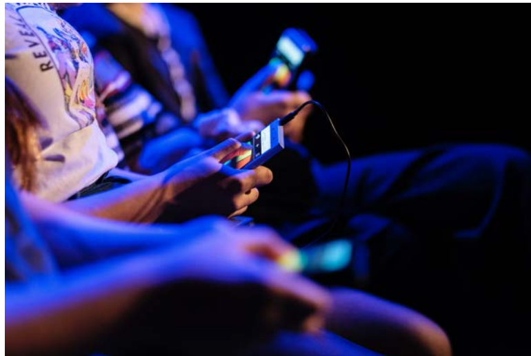
Fig. 1. Photo from Mobile Phone Orchestra performance

Voyage One is a 6-minute composition for a participatory Mobile Phone Orchestra (MPO) concept developed by Anders Lind. The MPO concept is designed to embrace people regardless their musical backgrounds as performers, but still with an aim to generate expressive and meaningful artistic expressions for concert hall performances. In a performance the MPO consist of 20-40 people, divided in 6 individual parts. They perform using their phones, and the dedicated MPO Web-API, as instrument interfaces. Animated notation is showing performance instructions for the 6 individual parts and conducting the performance. Voyage One was composed in 2017, during the early stages of development of the MPO platform. The work is a single movement composition, where 6 individual voices are introduced one after another to slowly build up an orchestral harmonic texture towards a concluding climax. The composition is characterized by tight constraints, where only four pitches are used in each voice, based on the previous conditions of the mobile phone orchestra's instrument interface. The challenge lay in creating musical coherence within this limitation of four pitches per voice by organizing the interaction among the six voices. For NIME 2024 Voyage One is performed by the audience at the conference.