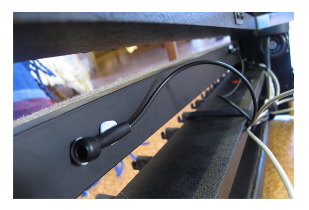
Figure 2: The microphones attached to the bottom of the damper bar.

The system was completely battery powered and the phone, preamp and batteries were small enough to sit on the end rail of the vibraphone. The array of four electret microphones could be Blu-Tacked underneath the bars of the vibraphone hidden from the audiences view and out of the way of the performer. The only "wired" aspect of the system was a pair of stereo jacks to connect the sound output to a PA system. The total cost, apart from the iPhone , was around A$100.