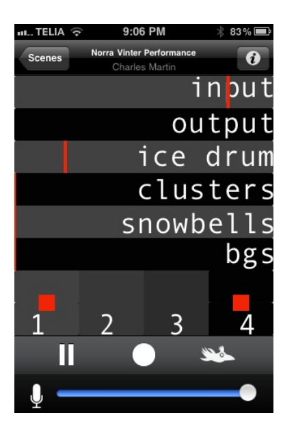
Figure 3: The RjDj interface for performing Nordlig Vinter .