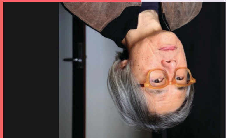
Phenomenologies of sonic gesture Atau Tanaka – Body music: