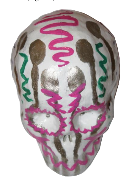
Figure 2. The Ceramic Skull with Conductive Pads.

Sugar skulls are generally hand-painted with colourful food colouring and decorated with shiny spangles. Hence, I have also painted the ceramic skull with six conductive paint traces which are integrated into a Kraakdoos circuit (Figure 2).