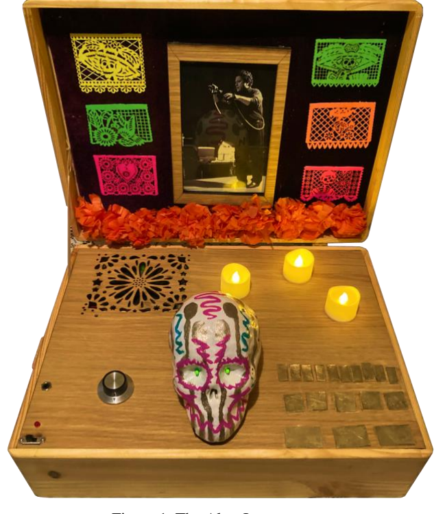
Figure 1. The Altar Instrument.

Licensed under a Creative Commons Attribution 4.0 International License (CC BY 4.0). Copyright remains with the author(s).