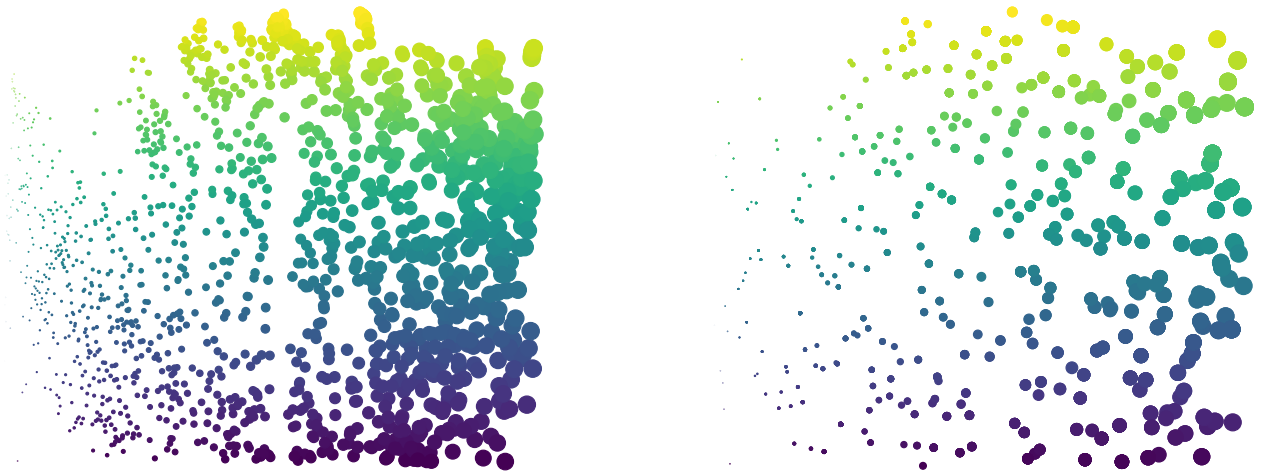
Figure 3: Example of the corpora in figure 2 after density equalisation. The colour and sizes are mapped to the same descriptors as x/y to show the low distortion this method entails.