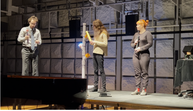
Figure 2: The T-Tree played by three of the authors in the live@CIRMMT performance.