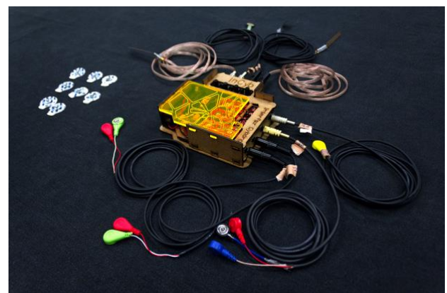
Figure 1. The Joakinator is composed of an Arduino MKR1010 microcontroller, three myoware-v2 electromyography (EMG) sensors and four flexiforce (FSR) sensors.