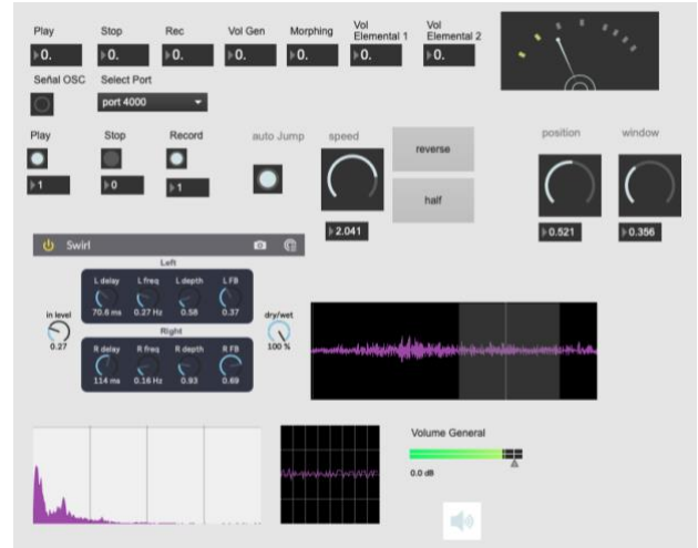
Figure 3. Patch created in MAX/MSP for the project Lo Permanente, 2022.

Joakinator integrates the body sensor interface, the communication system, the machine learning trained models, the sound instruments tailor-made and also the methodology of how to mix everything together.