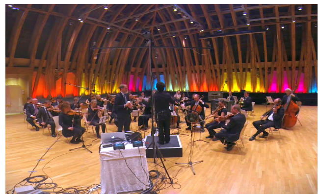
Figure 3: The recording setting in the Kuppelsaal

by orchestra and Trombosonic together. The second full rehearsal happened the day before the audio recording and music video production. The second full rehearsal and the production took place in the Kuppelsaal of the Vienna University of Technology . See Figure 3 for an impression of the production setting. The white table in the front hosts the laptop with the Trombosonic Max/MSP synthesizer, the DI boxes for recording, and a headphone amplifier for the conductor and the soloist.