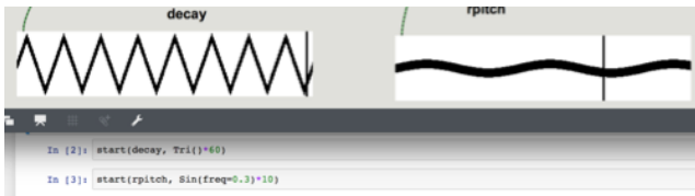
Figure 2: Curve visualization and code snippet from the Parameter Curves interface.

The signal chain consisted of a grain delay, a conventional delay, a pitch shifting module, and reverb. In an attempt to not overwhelm the guitarist with too much parameter change, only two parameters of these effects were ever being dynamically manipulated at one time. We designed a visualization where at least one period of the curve function would be shown, and a tracking line would move across time to show the current level of the effect (Figure 2).