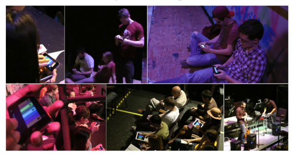
Figure 4 echobo performance footage<sup>1</sup>. A total of 105 participants joined the performance.

For future work, we wish to extend the application for more general musical styles in terms of its mapping and sounds. While keeping the key concept – a master musician restricting the musical expressivity of each audience member – we can make both the sound synthesis and mapping parts (chord-scale) of the application programmable so that an artist can personalize the musical instrument depending on the composition.