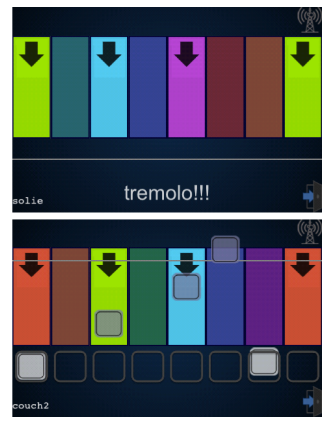
Figure 3A (upper) Key instrument is in F major. Keys of the selected chord are marked with a black arrow. Audience is instructed to play keys with black arrows more than others. 3B (lower) a pattern broadcasted is displayed as a set of notes coming from the top.

Interestingly, survey results indicated that the audience felt more connected to the clarinet player than other audience members and the master musician. Many participants commented that they felt that the master musician limited their musical expressivity by "taking away" keys too often. In addition, interactions among the audience were not as effective as desired despite the high rate of broadcasting patterns. It seemed that playing in sync with the randomly selected participants was not clear enough to make them feel a sense of collaboration due to the limited volume of mobile phones and the arbitrary locations of those selected. With respect to this weakness, some participants suggested that they would like to have visual feedback on who (or how many) were following the pattern.