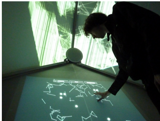
Figure 4: The “Membranes” Piece

an agent spring is created or destroyed, a strong excitement is applied to the acoustic spring. The location of the acoustic spring in the sound-field is determined by the centre position of the spring agent. The musical output consists of a slowly undulating texture that is occasionally interrupted by discrete and loud sounds that result from the creation and destruction of springs. The visual output displays the connectivity of the springs' mesh as stacks of triangles and the small fluctuations of the springs' mass points as interconnected lines the follow the points' trajectories [see figure 4].