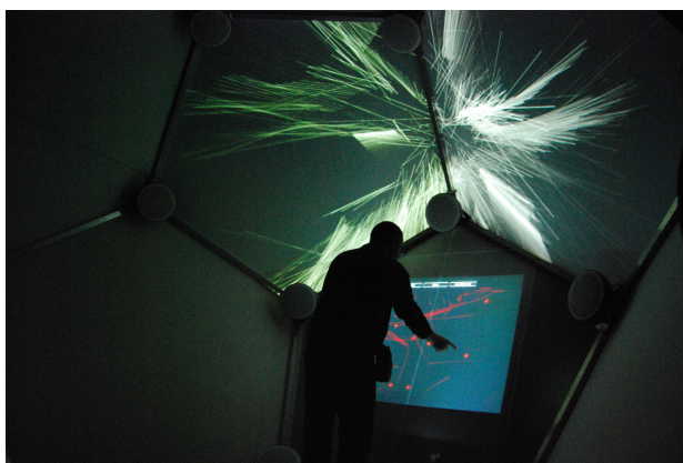
Figure 3: The “Flow” Piece

The “Flow” piece exploits the existence of periodically recurring events within the simulation in order to generate rhythmical structures in the acoustic and visual output. These recurring events originate from repeated changes in the neighbourhood relationships between two different swarms: a predominantly static swarm whose agents are attached to the visitors' touch positions and a highly dynamic swarm, that traverses the static swarm. As long as the visitors do not move the static agents, the dynamic agents settle into cyclic trajectories that cause them to periodically approach the static agents and thereby trigger the generation of sound grains whose content is created via additive synthesis. The duration and acoustic spatialisation of the grains and the frequencies of the oscillators is controlled by the dynamic agents' position, velocity and jerk. Accordingly, the musical motif is dominated by stable rhythmic patterns whereas the texture of the individual sounds constantly varies. The visual output renders the static agents as a mesh of lines that interconnect the agents' positions [see figure 3]. The discrepancy between the large scale repetitions and local variations in the trajectories of the dynamic agents is visually emphasized by drawing the trajectories as thin lines that rapidly widen into series of spokes according to the agents' jerk.