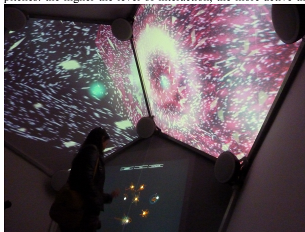
Figure 2: The "Impacts" Piece

Starting from a strongly interactive premise, the flocking algorithm in this piece explores the possibility of hierarchical relationships between several flocks, similar to the interdependence within an ecosystem or food chain. There are three types of entities present in the "Impacts" model: the first type of agent is the attractor. Its behaviour is fully dependent on the visitor's action since it can't move by itself but is displaced by the visitor's touch. The agents of the secondary swarm influence their own kind and react to the attraction forces of the first swarm. They serve as attractors to the agents within the third swarm. The behaviours of the agents within the second and third swarms are parameterized in such a manner as to create very dynamic motion patterns. The music consists of a background layer of Ambisonic ambience of the Notre Dame cathedral in Paris. The individual collisions between agents in the swarm simulation trigger piano samples on impact and a granular echo of the same pitch when an escape point is reached. In the true spirit of emergent structures, the mixture of all of these events alone is what generates the characteristic texture of sounds. The user interaction controls the choice of pitches: the higher the level of interaction, the more active the