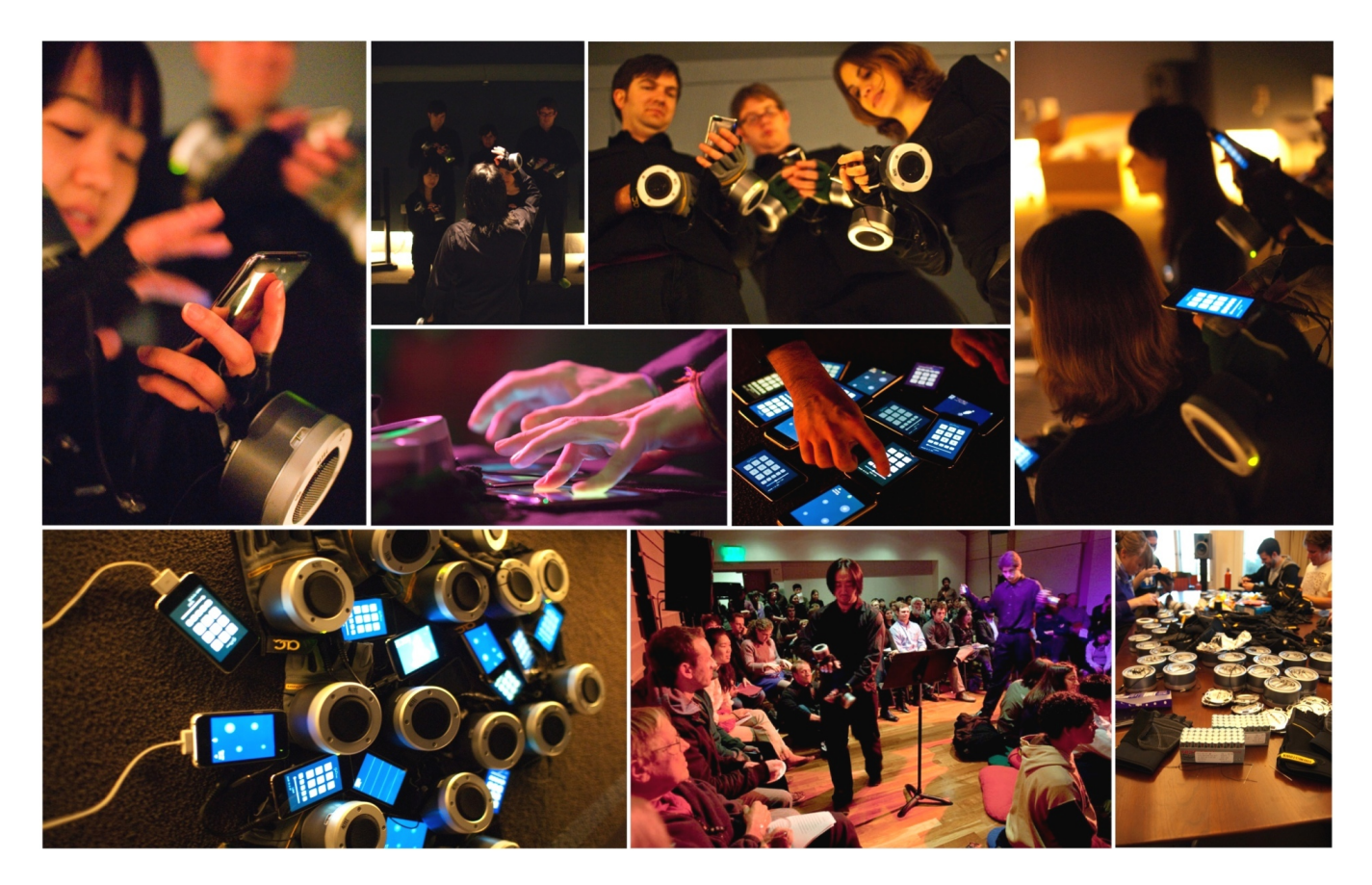
Figure 1: The Stanford Mobile Phone Orchestra

2007, as a repertoire-based ensemble using mobile phones as the primary instrument, was intended to further these concepts as well as explore new possibilities. The increasing computational power of mobile phones has allowed for sound synthesis without the aid of an external computer. In fact, mobile phones have come to be regarded more as "small computers" with PC-like functionality than as simply phones with augmented features. For the purpose of music making, one may even regard the phone as being superior to computers, offering light-weight yet expressive interactive techniques made possible by its various on-board sensors.