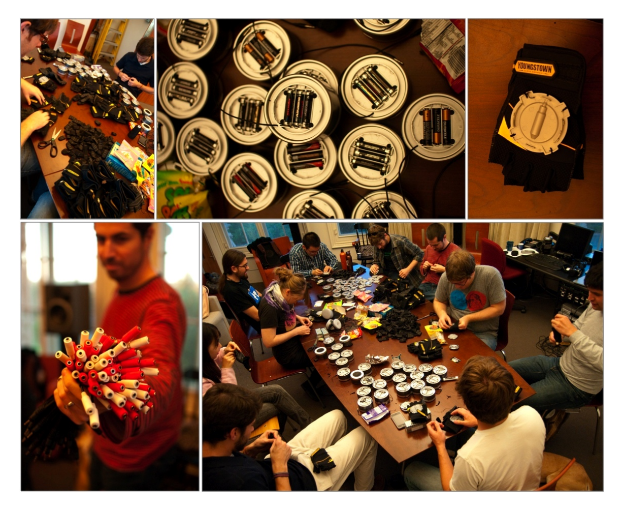
Figure 2: Building the Speaker Gloves

employed minimal tools. The prototype designs were quite basic, but nonetheless allowed testing on usability and interaction experience (Figs. 3, 4). While the necklace and jacket designs served the basic purpose of amplification, they felt bulky and difficult to control, especially the directionality of sound. On the other hand, the close proximity and controllability of the gloves in relationship to the phone seemed to provide a much more satisfying, immediate, and transparent user experience.