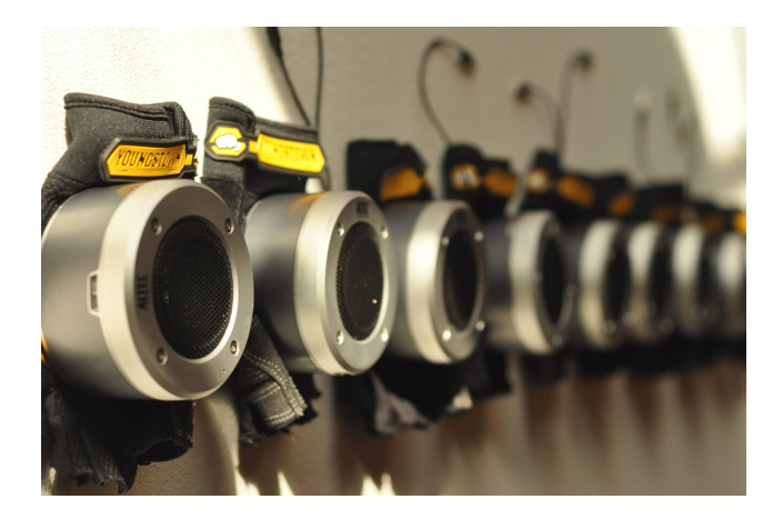
Figure 4: Selected Prototype Design: Speaker gloves

the Objective-C programming language using the XCode development environment. The iPhone SDK provides tools for graphically designing and testing user interfaces (Interface Builder), and projects can include C or C++ code. To streamline instrument development, an additional layer of abstraction has been created on top of the iPhone SDK through the MoMu Toolkit, greatly simplifying audio input/output, synthesis, and on-board sensing among other things [1].