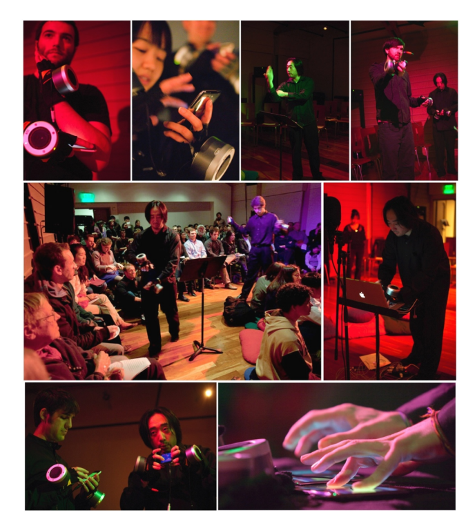
Figure 5: Stanford Mobile Phone Orchestra Concert: December 3, 2009

A concert in December 2009 gave MoPhO an opportunity to explore capabilities provided by these new hardware and software platforms. The instruments and pieces presented in this performance were built using the Mobile Music Toolkit