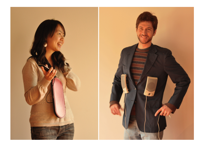
Figure 3: Prototype Designs: Speaker necklace and speaker jacket

The change in hardware consequently led to changes in the software environment. The previously used Nokia N95 smartphones run Symbian OS, use C++ and Python programming languages, and require a somewhat complex ini-